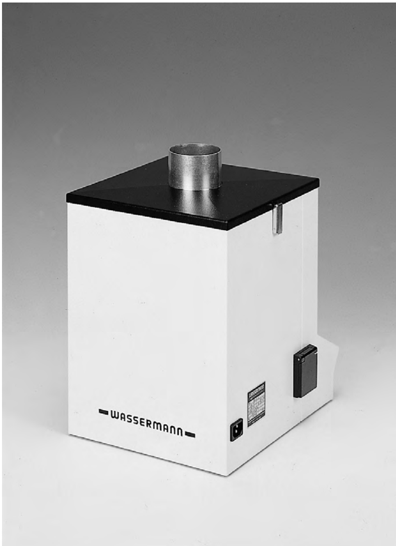
Fig.: SG 1/1